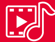
Media hub making headlines