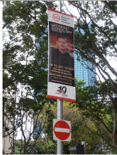
Non-decorative lamppost with one single-sided banner (e.g. Cuscaden Road)