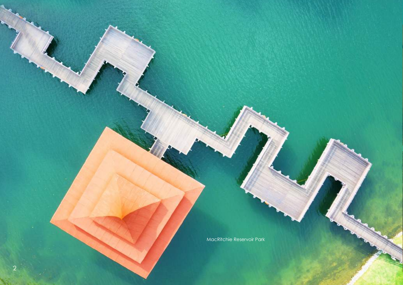
MacRitchie Reservoir Park

To spark your event passion, here are the city's latest incentive experiences and meeting venues where progressors can network, exchange ideas and build team bonds.