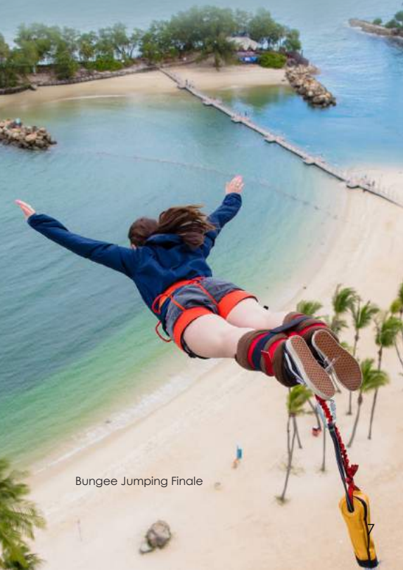
Bungee Jumping Finale

Top Swing: Sitting in a harness, participants are dropped from the jump deck in a seated position