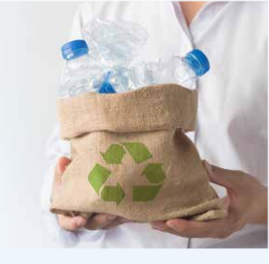
Figure 2: Event organisers' consideration of current and future sustainability actions

Research among event organisers identified areas where they currently consider sustainability and where they felt they could take action in future<sup>12</sup>. Reducing visible waste was the simplest area of action, while requiring event materials to be made sustainably or requesting energy data were least preferable. Much of the reasoning is based on perception of where organisers have control, as showing in Figure 2: